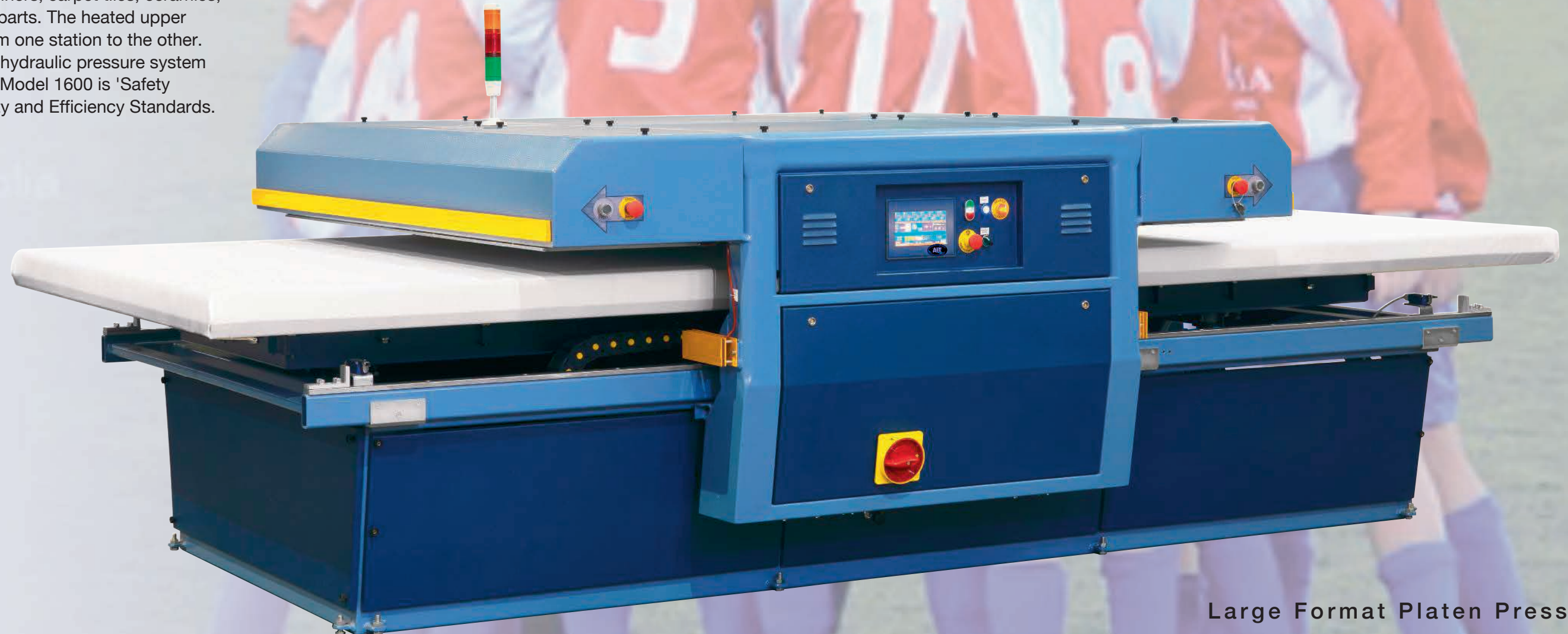
Large Format Platen Press

The AIT Model 1600 is a fully automatic large format heat transfer printing system specifically designed for Dye Sublimation printing of flags, banners, carpet tiles, ceramics, wood, plastics, and cut apparel parts. The heated upper platen automatically indexes from one station to the other. The multi-zone heat control and hydraulic pressure system provides consistent quality. The Model 1600 is 'Safety Certified' and meets all EC Safety and Efficiency Standards.